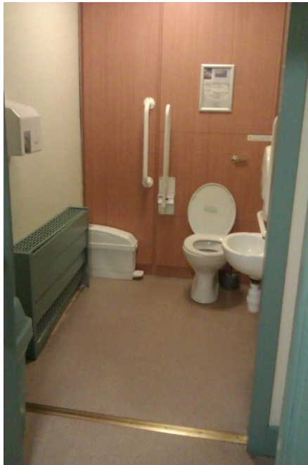
Upper Floor WC