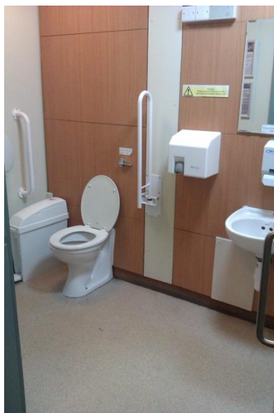
Ground floor WC