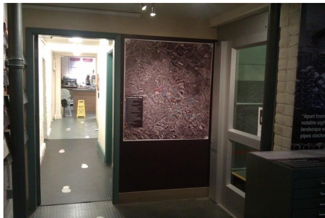
Ground Floor lift access