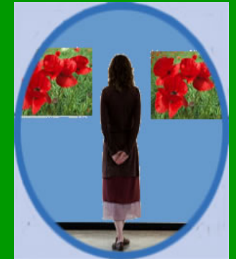
Ashby Camera Club